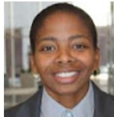
Courtney Martin Public Relations